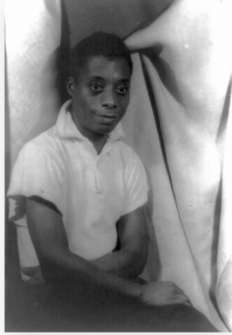
James Baldwin, photographed by Carl Van Vechten, 1955

African American writers and thinkers have written countless books, novels, plays, poems and essays, many of which have become unforgettable testaments to Black perspectives and resilience through the decades. From examining the institution of slavery to the intricacies of navigating life as a Black individual, this list recounts many moments of the Black experience.