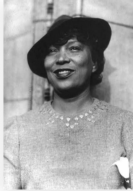
Zora Neale Hurston