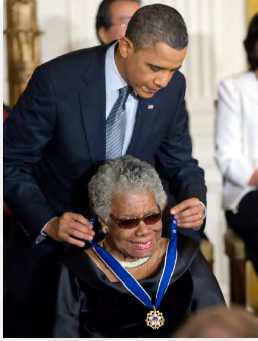
President Barack Obama presenting Maya Angelou with the Presidential Medal of Freedom